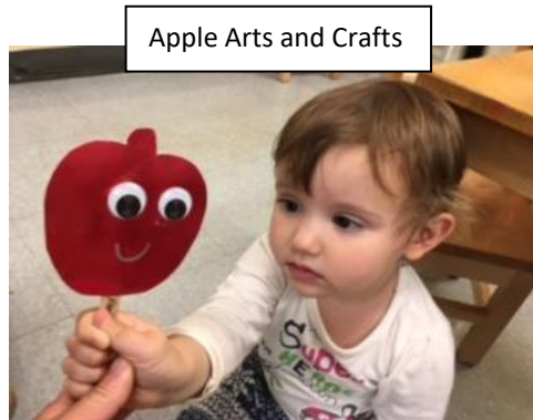
Apple Arts and Crafts