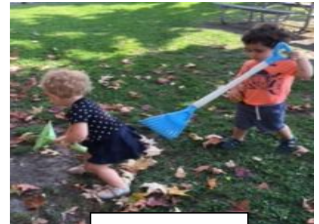
Science Nature Walk

It was amazing to observe that our busy toddlers were all enjoying their arts and crafts time. This activity will enable our toddlers to develop their fine motor skills (palmer and pincher grasp), social/emotional skills (sharing) and language skills (communicating to their classmates). They loved painting, hand and finger painting, pasting, and stamping. We hope that our adorable toddlers made you smile while looking at their awesome Rosh Hashanah arts and crafts.