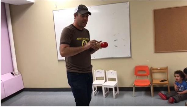
Monkey Rock comes and shows the children all kinds of Musical instruments! (Top left)