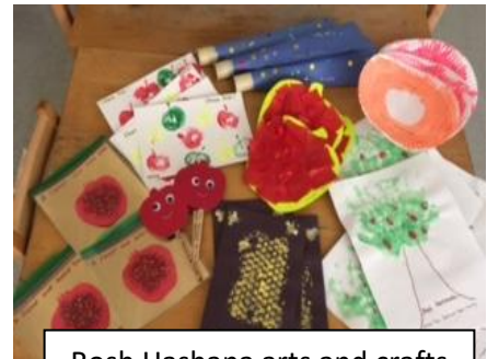
Rosh Hashana arts and crafts galore!

The most favoured activities are outdoor play and science nature walk. They are energetic, and they love to run, play ball, and play sand. They are also curious to learn about everything. They love to observe their surroundings.