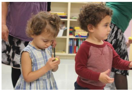
Toddlers line up to place Honey Bees on the flowers

Our dear toddlers enjoy doing pretend play most of the time during their free play time. They are so imaginative and creative to act and talk as if the play was real. Pretend play is the way where in our toddlers express themselves and apply what they have learned and observed from adults.